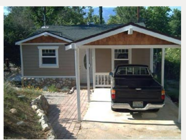
Quail Hollow West...Before and after.