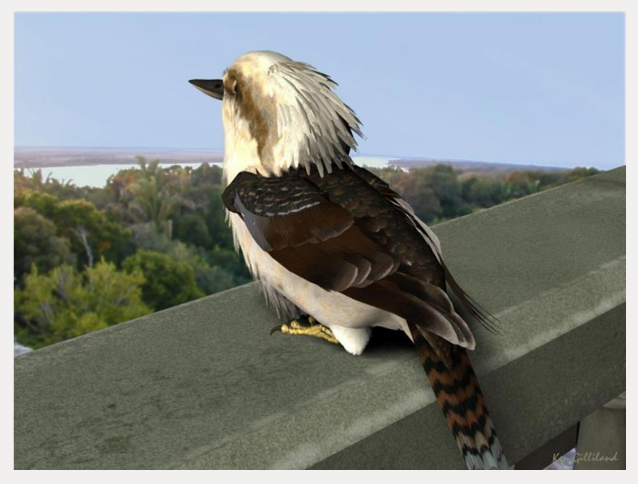
What are your plans for the songbirds? Are you going to expand to include, say, webbed feet birds?

Well, the initial plans with Songbird ReMix2 are to offer a variety of what's possible with the new morphs. Included will be hummingbirds, a cockatoo, a raven, a pigeon, quail and, of course, that Laughing Kookaburra. This will be followed quickly with some bird specific add-on packages such as Parrots of the World, Hummingbirds of North America (and their young) and Pigeons, Doves and Game birds.