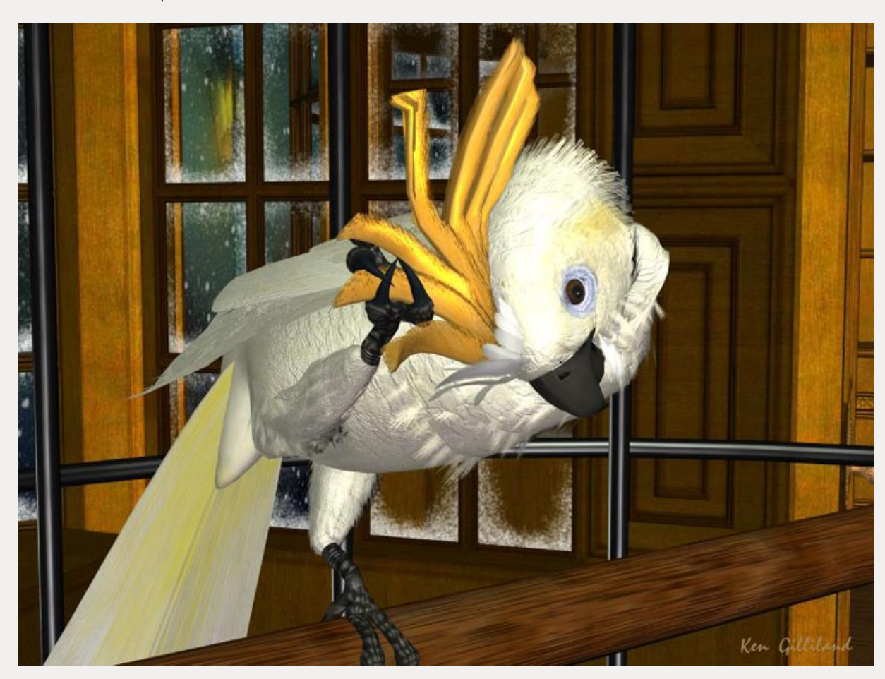
I understand you recently were guests at an event of the California Audubon Society. Can you give us a little idea what it was about?

That's a tough question, since every package has at least one favorite bird. If I was pushed into a corner, it probably would be "Threatened, Endangered, Extinct" because of its message.... I will add though, my latest "Songbird ReMix2" runs a close second because of the California quail and Cockatoo that are included.