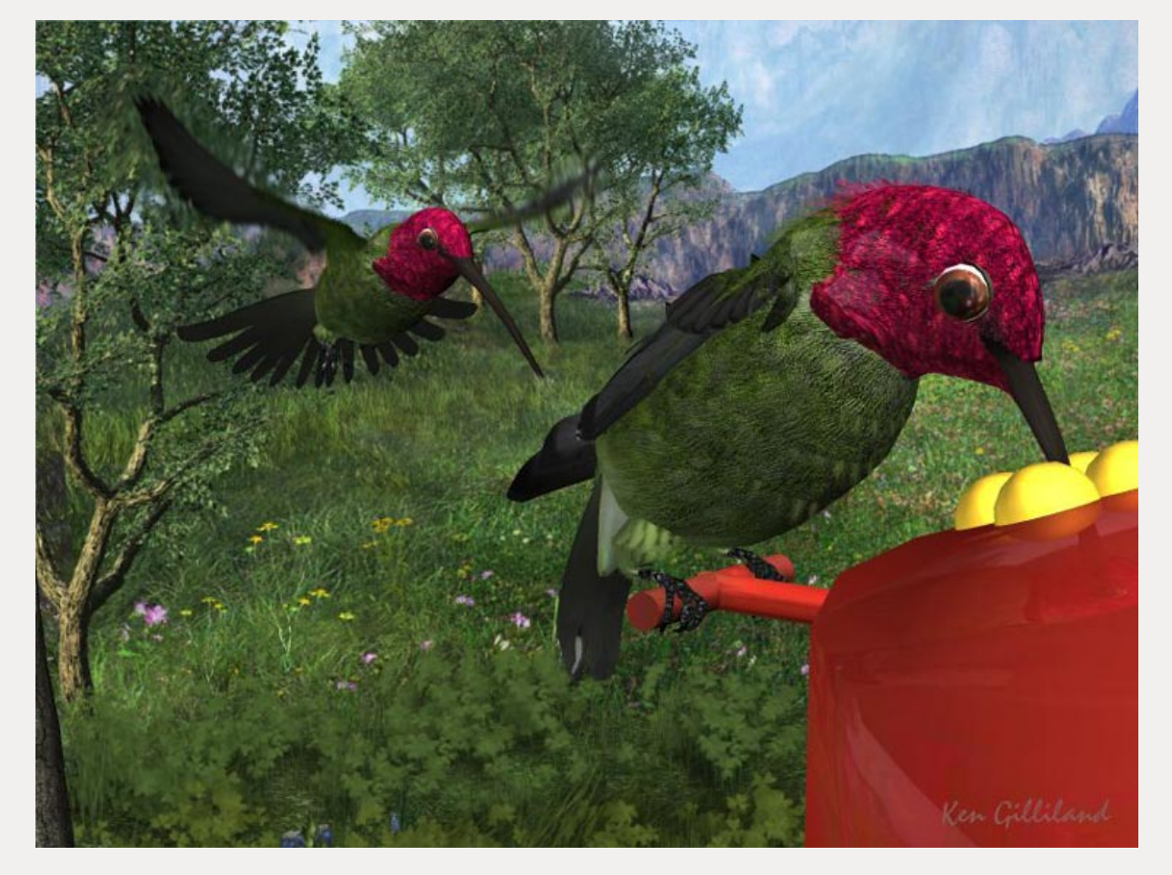
I know your passion is with endangered species, both birds and plants. Can you give us some more information about this?

Well, my interest in the natural world came at an early age with a father who was a high school biology teacher. This early education continued with lots of backpacking and day hikes through the scouting programs. An introduction to Native American's belief system got me thinking now I could work with our natural environment rather than plow through it.